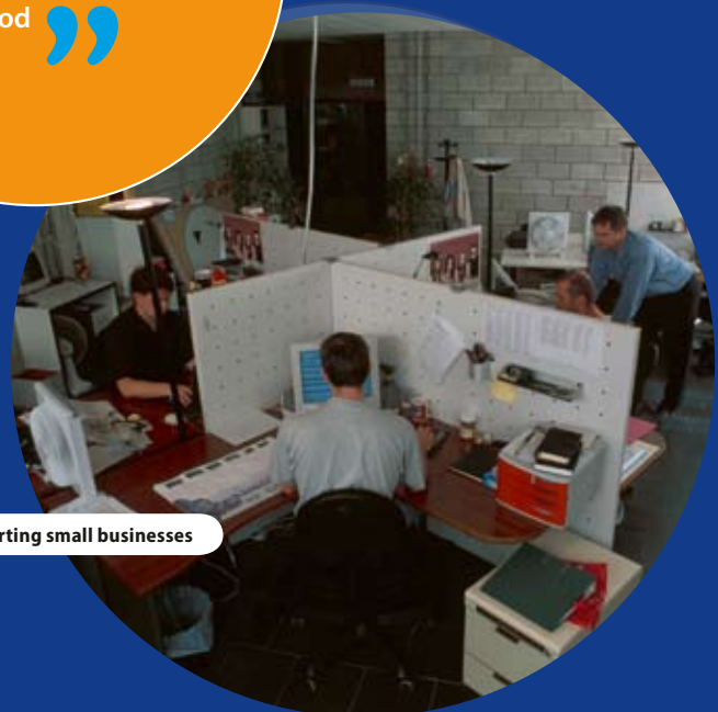
Supporting small businesses

Yes and no. It is clear that funding needs to be large enough to make a difference which implies it should not be spread too widely across policy areas. But because regions differ in terms of the problems they face and their specific needs, which are hard to identify centrally, there is a case for allowing them to choose a limited number of areas on which to concentrate funds. This would also make it easier to monitor and evaluate Cohesion Policy.