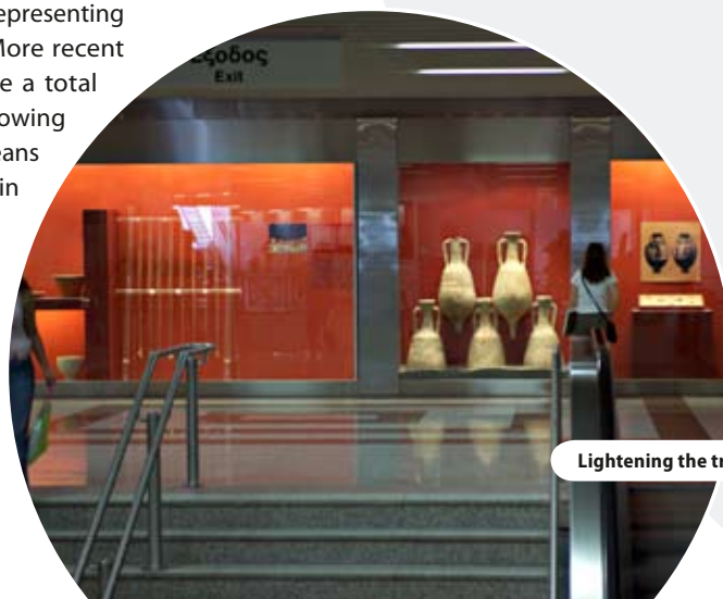
Lightening the traffic load in Athens