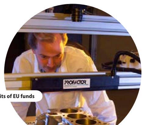
The Profactor project showed the benefits of EU funds

“The long track record of programme monitoring in Germany provides a firm foundation for the increasingly wide-ranging indicators being tracked today”