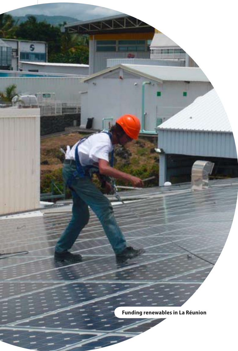
Funding renewables in La Réunion

“ What began as a duty for programme control is now becoming an example of modern management in public administration ”