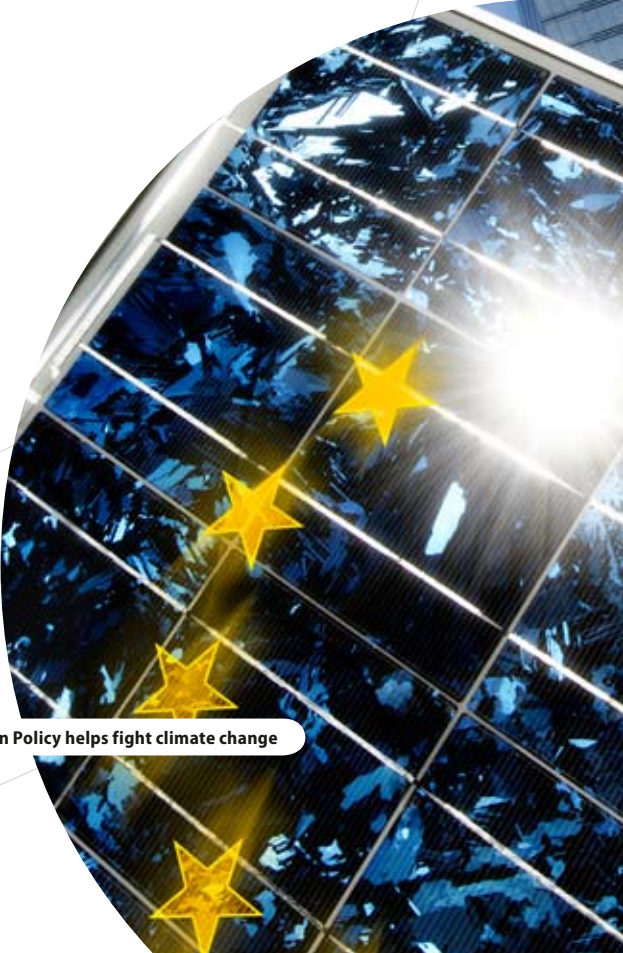
Cohesion Policy helps fight climate change